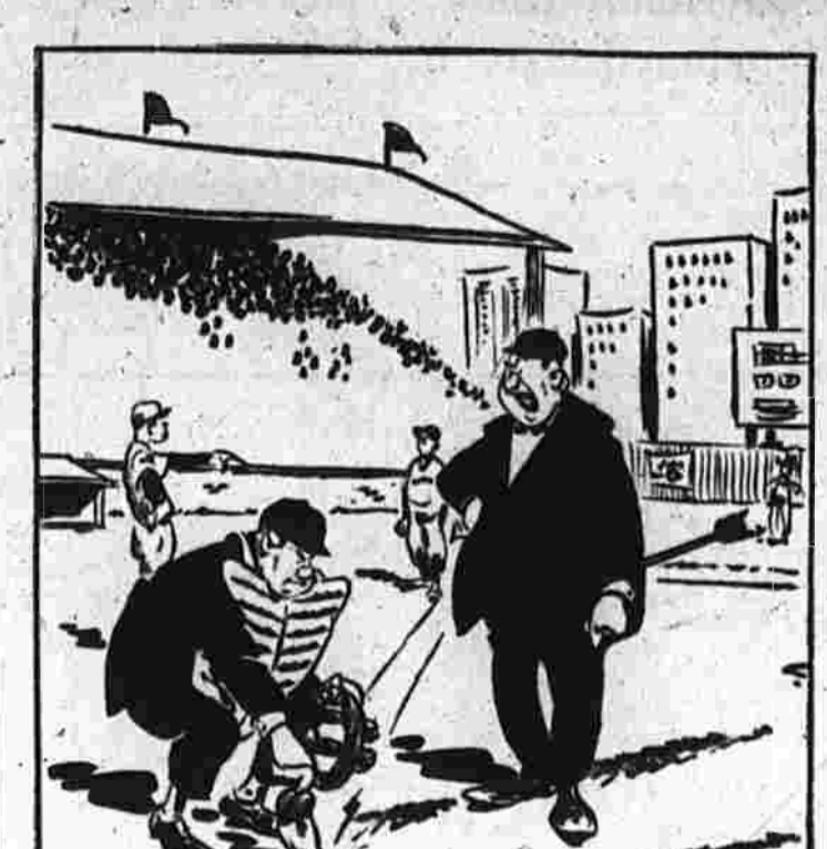
Sense and Nonsense