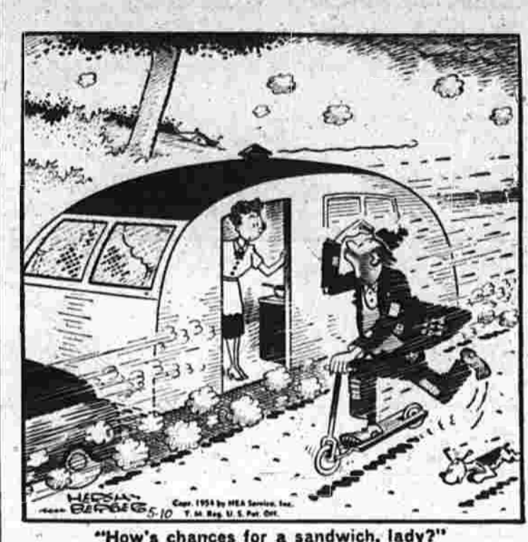
How's chances for a sandwich, lady?