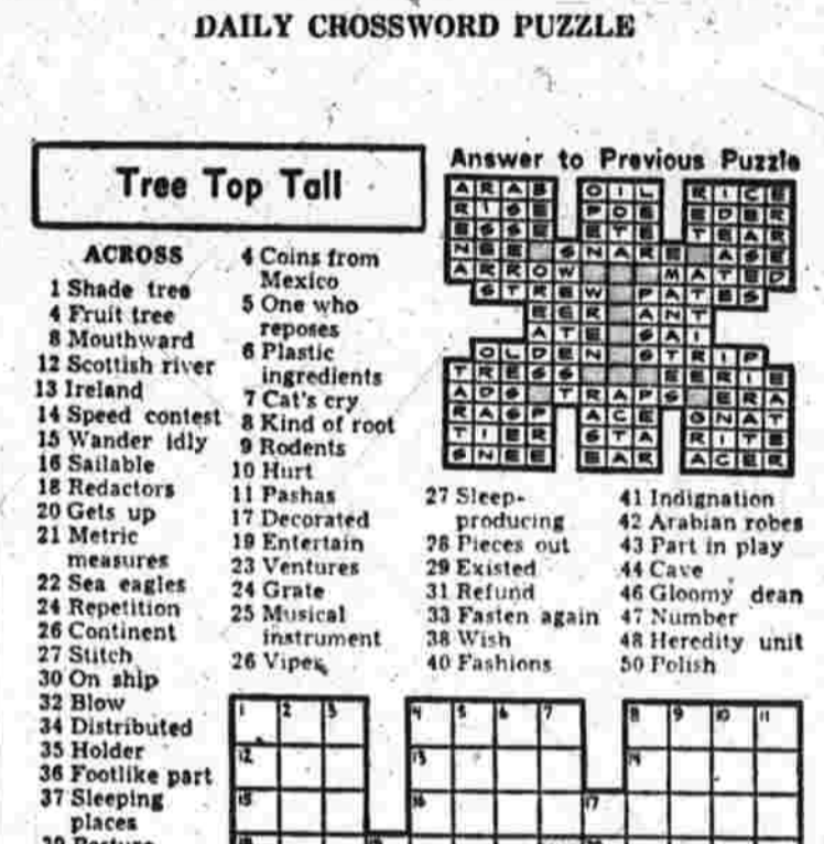
Tree Top Tall